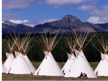
World Indigenous Peoples Conference on Education (2002), Montevideo