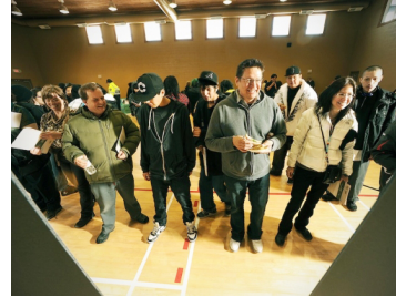
Stoney Nakoda Youth Advisory Council (2011)